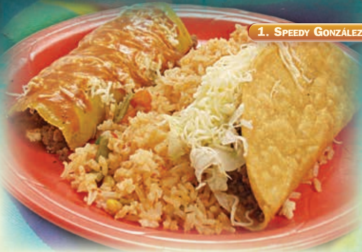
1. SPEEDY GONZÁLEZ