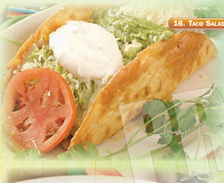
16. TACO SALAD