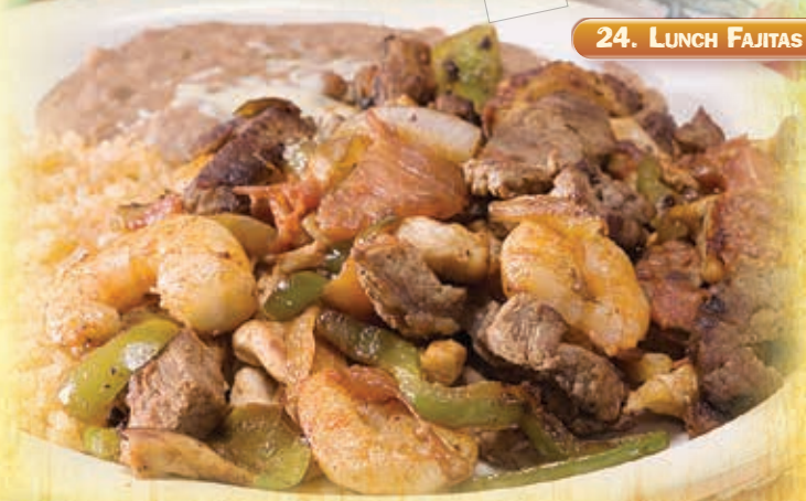
24. LUNCH FAJITAS