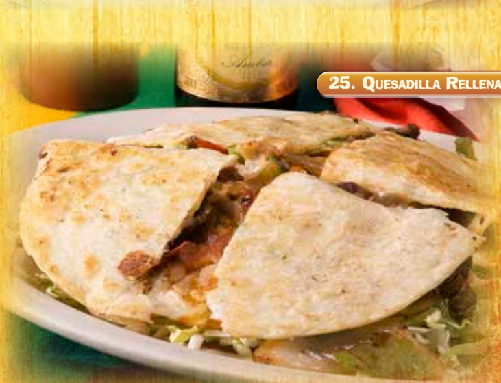
25. QUESADILLA RELLENA

Consuming raw or undercooked meat, poultry, eggs, shellfish or seafood may increase your risk of foodborne illness.